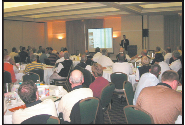
The USGA Eastern Calibration at Tampa Palms Country Club.