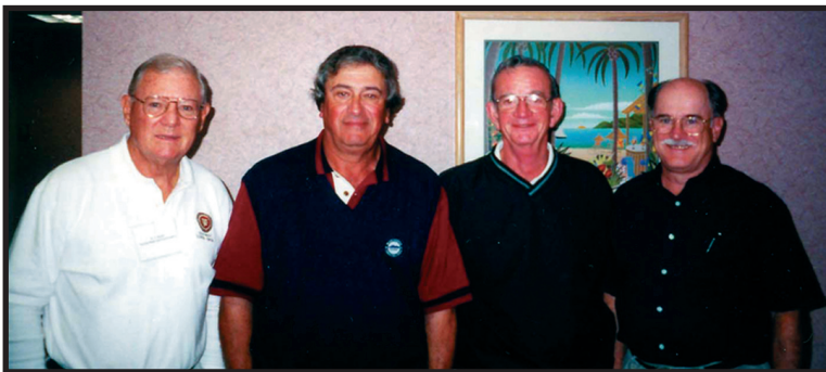
The FSGA team at the 2002 Calibration.